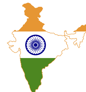
INDIA & SUBCONTINENT